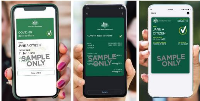
(shown on the Express Plus Medicare app)