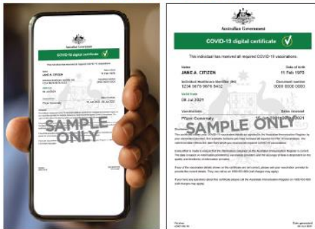
(shown on a Medicare online account through myGov)