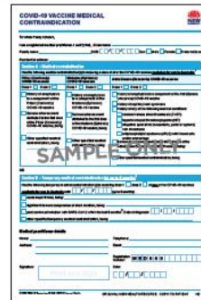
(shown as a printed copy. Must be signed by a doctor)